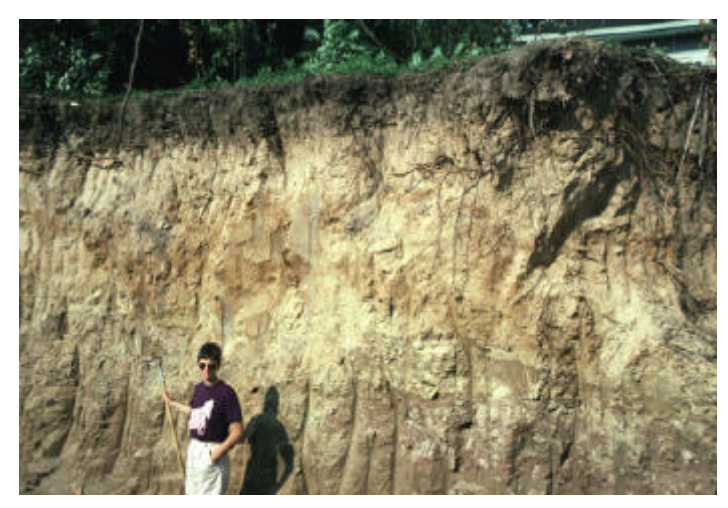
The top several feet of soil contain different layers called horizons. The permeability of these horizons controls how quickly water and potential contaminants are transported into aquifers.

The chemical properties of the soils also reflect the surficial geologic processes. The highest concentrations of calcium carbonate in the soil are generally clustered in regions formed of till. Calcium carbonate concentrations are generally lower in the outwash plain region located in the central part of the county. Bicarbonate (HCO<sub>3</sub><sup>-</sup>), an ion formed when calcium carbonate is dissolved by infiltrating water, has been shown to encourage the dissolution of arsenic (Kim, 1999).